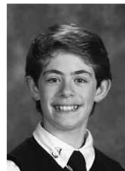
Franklin Ludwig St. Ignatius HS